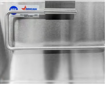
Towel Paper Dispenser